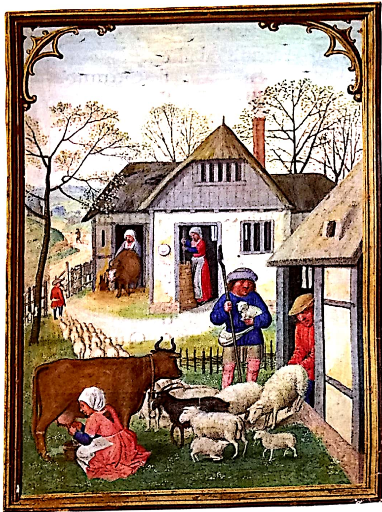
Peasants' homes were small and crowded with people and animals.

Peasants ate vegetables, meat such as pork, and dark, coarse bread made of wheat mixed with rye or oatmeal. Almost no one ate beef or chicken. During the winter, they ate pork, mutton, or fish that had been preserved in salt. Herbs were used widely, to improve flavor and reduce saltiness, or to disguise the taste of meat that was no longer fresh.