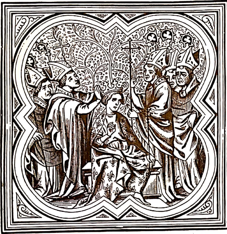
In 800 C.E., Charlemagne was crowned Holy Roman emperor by Pope Leo III.

For 500 years, much of Europe was part of the Roman Empire. The rest of the continent was controlled by groups of people the Romans called “barbarians” because they did not follow Roman ways. When Rome fell to invading barbarians in 476 C.E., Europe was left with no central government or system of defense. Many invading groups set up kingdoms throughout Western Europe. These kingdoms were often at war with one another. The most powerful rulers were those who controlled the most land and had the best warriors.