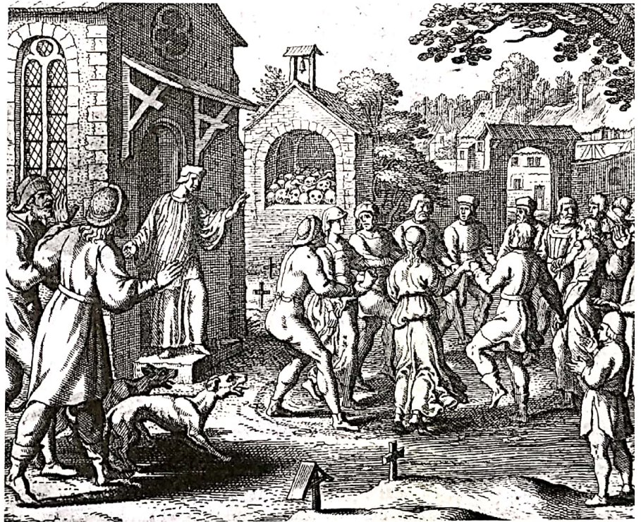
During the plague, a dancing mania spread among those who remained healthy—an expression of people's joy of life during those dark times.

The most famous of these revolts was the English Peasants' War in 1381. The English rebels succeeded in entering London and presenting their demands to the king, Richard II. The leader of the rebellion was killed, however, and after his death, the revolt lost momentum . Still, in most of Europe, the time was coming when serfdom would end.