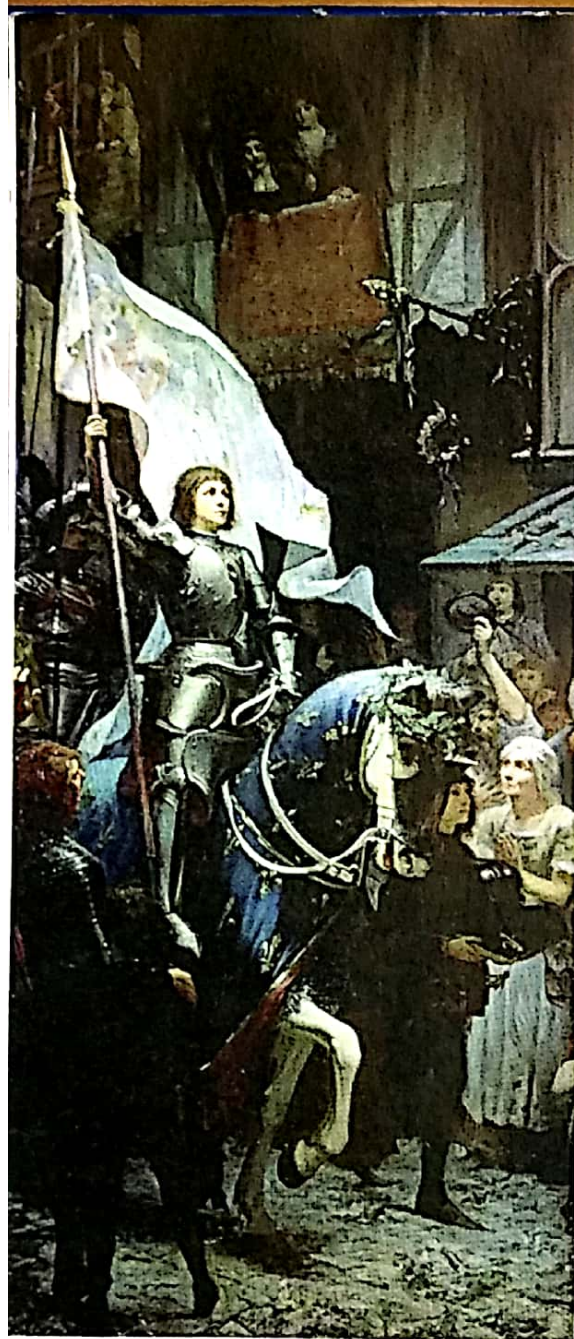
Joan of Arc inspired the people of France to fight. To this day, she is honored for her heroism. A late 19th-century artist painted this scene called Entrance of Joan of Arc into Orleans on 8th May 1429 .