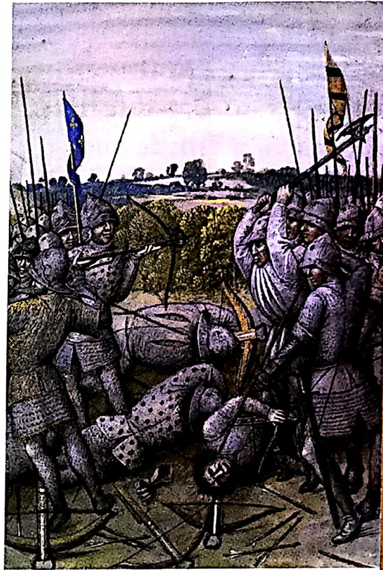
At the Battle of Crécy, the English army's lighter armor and longbows triumphed over the French knights' heavy armor and crossbows.

In both France and England, commoners and peasants bore the heaviest burden of the war. They were forced to fight and to pay higher and more frequent taxes. Those who survived the war, however, were needed as soldiers and workers. For this reason, the common people emerged from the conflict with greater influence and power.